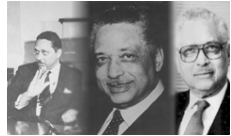
Rev. Dr. Leon H. Sullivan (1922 – 2001)

Disabilities for which the law may require a reasonable accommodation are physical or mental impairments that substantially limit a major life activity, such as self-care, walking, seeing, hearing, speaking, breathing, or learning. Reasonable accommodations may include alterations to rules, policies, or practices, removal of architectural or communication barriers, or the provision of auxiliary aids. SAOIC has the right to refuse to provide an accommodation that poses a direct threat to the health and safety of others, constitutes a substantial change or alteration to an essential element of a course or program, results in an undue financial burden or administrative hardship, or is considered a personal device or service (i.e. wheelchairs, hearing aids, personal transportation).